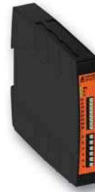
Emergency stop module UF 6925