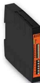
Emergency stop module UF 6925